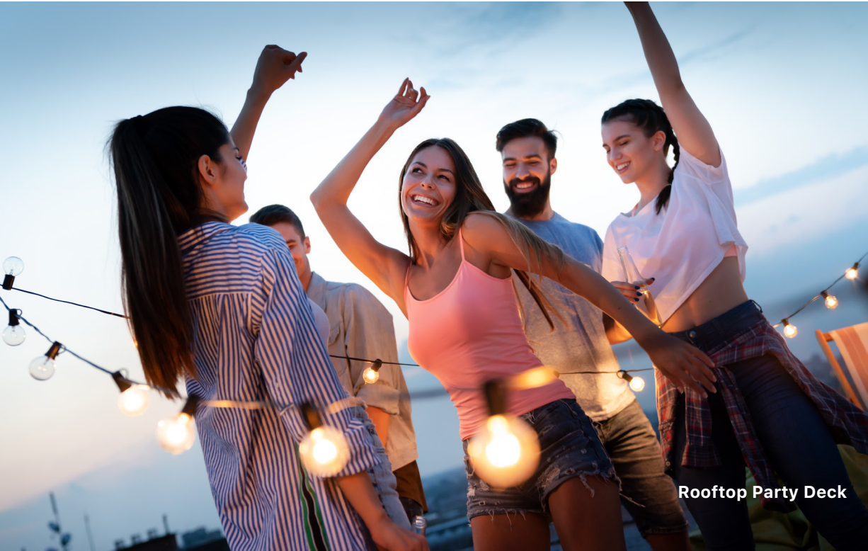
Rooftop Party Deck